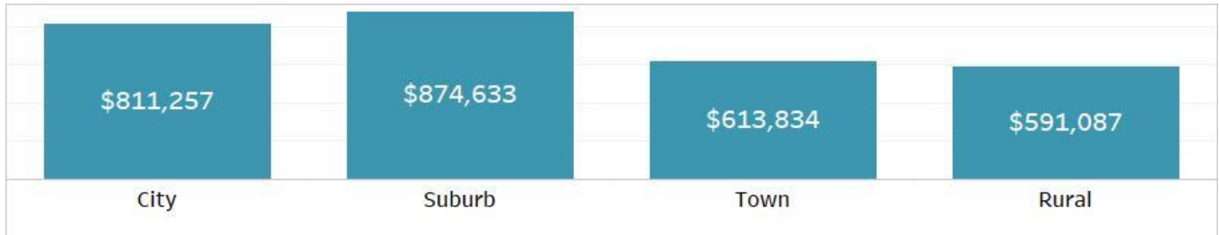
Chart 5: Total School District Capital Expenditure Averaged per School, by District Locales FY2009-2018 (2020$)