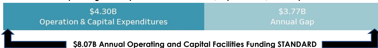
Chart 1: Annual Operating and Capital Facilities Standard, Expenditures, and Gap ▾

Pennsylvania school districts spent a combined annual average of $4.3 billion of their operating and capital budgets on facilities. However, the annual funding benchmark for good stewardship standards for PK-12 public school facilities operating and capital budgets is 7 percent of the CRV. Seven percent of CRV of all Pennsylvania's PK-12 public school buildings is $8.07 billion per year. iv This means that Pennsylvania's students, teachers and communities are using public schools that have a combined facilities operating and capital budget gap of $3.8 billion every year.