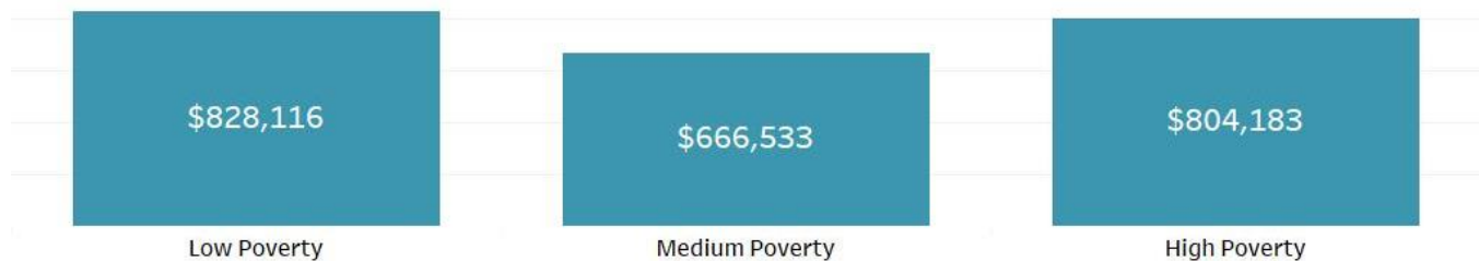
Chart 3: Total School District Capital Expenditures Averaged per School, by % Economically Disadvantaged Students FY2009-2018 (2020$)